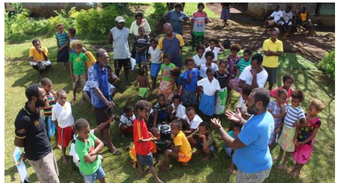
TI Vanuatu conducts outreach and awareness raising activities on democratic principles and governance processes