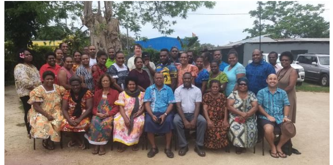
Meeting with the Vanuatu Association of NGOs (VANGO)

In 2022, Transparency Vanuatu strengthened partnerships with multiple stakeholders , including the Ministry of Justice, Ministry of Youth and Sports, Ministry of Internal Affairs, Ombudsman, Public Prosecutor, and the Electoral Office. This resulted in the chapter being appointed member of important National Committees dealing with good governance, transparency, and political integrity. The chapter also continued to collaborate and support the Vanuatu Association of NGOs (VANGO) and strengthened relations with other CSOs, especially with gender and disability groups.