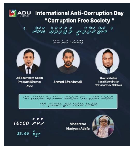
TI-Maldives Participates in the Special Program hosted by PSM to mark International Anti-Corruption Day

To mark the occasion of International Anti-Corruption Day TI Maldives participated as a panellist on a special program hosted by Public Service Media, 'ADU', that was broadcasted nationwide in the Maldives on the 9 th of December 2022. The discussion covered topics such as: why corruption occurs, the harm caused by corruption and approaches to curb corrupt practices. The program's main objective was to increase awareness of working towards a corruption-free society. In addition to TI-Maldives, the Anti-Corruption Commission and an activist working in this area took part in this informative discussion.