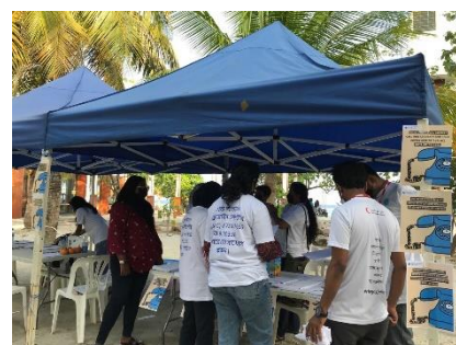
Transparency International Maldives providing advice at the Health & Legal Camp for Migrants, held at International Migrants Day