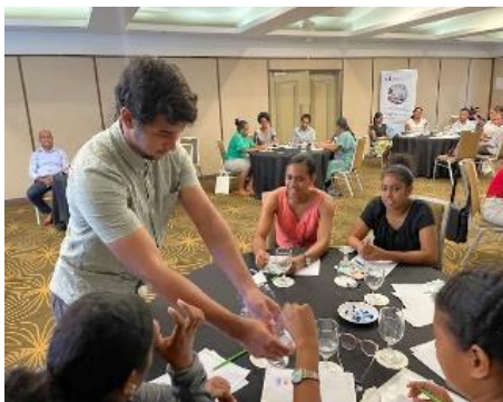
A mock election is held during the workshop

One of the highlights for Jared was the workshop organised with the Fijian Elections Office to explain Fiji's national electoral process and to encourage more young people over 18 to vote. The 18 to 25 demographic group recorded the lowest percentage of voters in the 2014 and 2018 national elections.