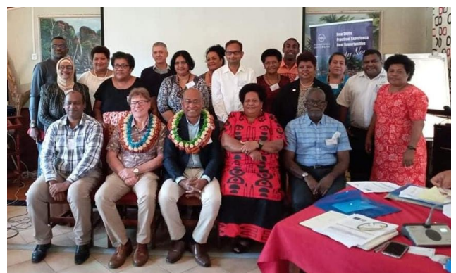
Integrity Fiji with partners at Fiji National University