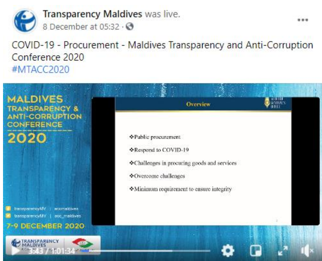
TI Maldives advocates for transparency and best practices in emergency public procurements during the COVID-19 pandemic

The environment for civil society in the Maldives has significantly changed in the last years. Until recently, civil and political liberties were severely restricted by the state. The Maldives scored very low in Transparency International's Corruption Perceptions Index (CPI) , dropping from 31 to 29 points in 2019, and placing the country at the rank 130 (out of 180) in the 2019 Index. However, the election of a new administration in September 2018 resulted in new opportunities for TI Maldives and civil society actors to engage government and institutions on anti-corruption, a welcome change for the country where, according to Transparency International's Global Corruption Barometer – Asia 2020 (GCB) , 90% of the population still believes that government corruption is a big problem.