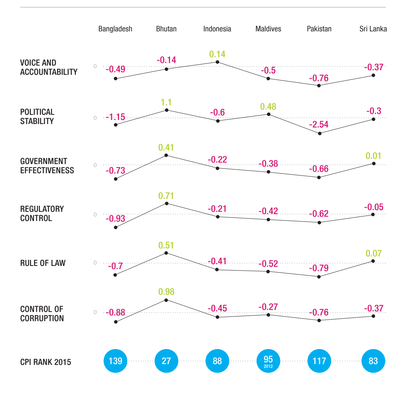
TABLE 1: COUNTRY SCORES AGAINST GLOBAL GOVERNANCE INDICATORS AND CORRUPTION PERCEPTION INDEX

Since the Corruption Perception Index did not cover the Maldives in 2015, its rank and score in the 2012 Index has been used here to demonstrate the level of corruption in the country.