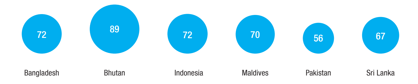
FIGURE 4: COUNTRY-WISE SCORES FOR PREVENTION, EDUCATION AND OUTREACH DIMENSION

Figure 4 below reveals that the average score of the ACAs for this dimension is in the range of from 56 (Pakistan) to 89 (Bhutan), with a mean of 71.