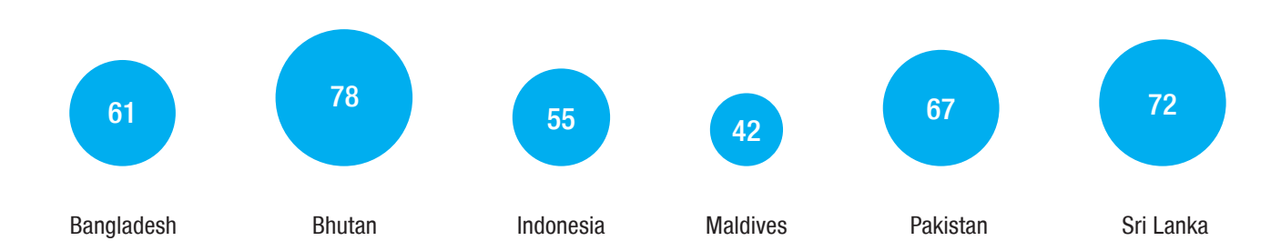
FIGURE 2: COUNTRY-WISE SCORES FOR THE FINANCIAL AND HUMAN RESOURCES DIMENSION

The figure below reveals that the average score of the ACAs for this dimension is in the range of from 42 (the Maldives) to 78 (Bhutan), with a mean of 62.5.