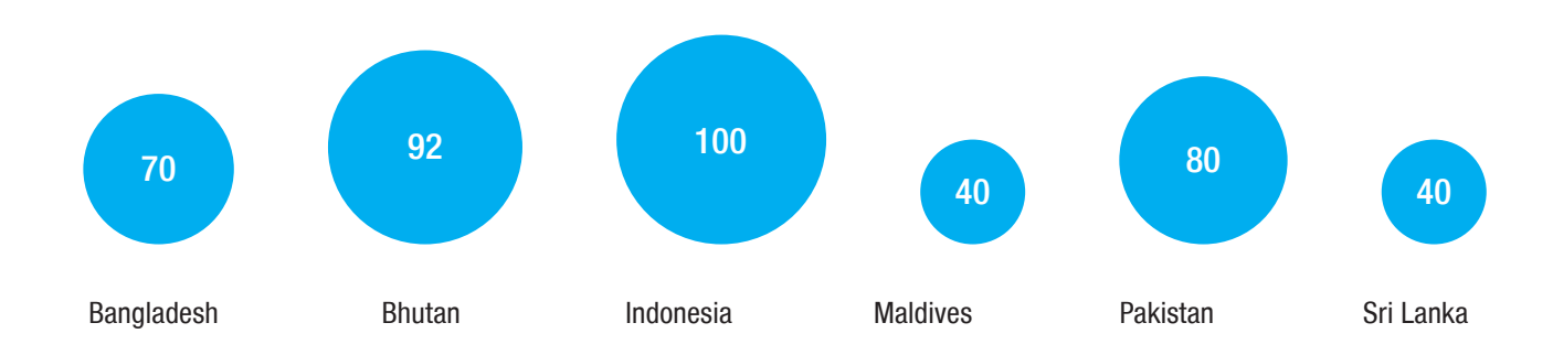
FIGURE 5: COUNTRY-WISE SCORES FOR THE COOPERATION WITH OTHER ORGANISATIONS DIMENSION

The figure below shows that the average score of the ACAs for this dimension is in the range of from 67 (Sri Lanka) to 92 (Bhutan), with a mean of 70.3.