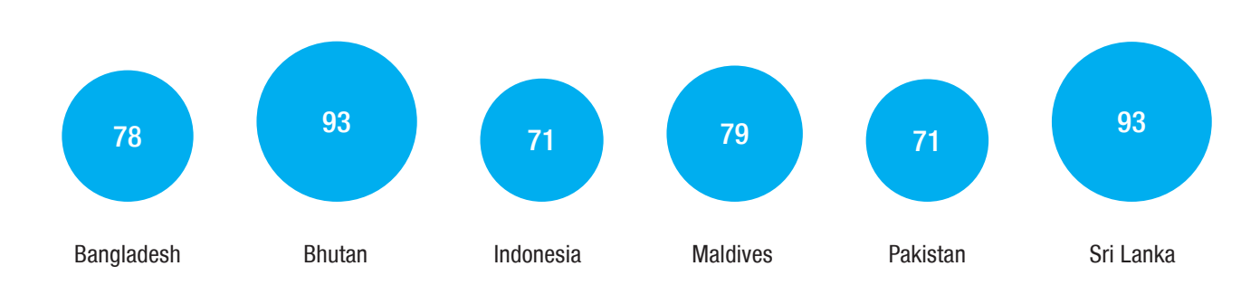
FIGURE 1: COUNTRY-WISE SCORES FOR LEGAL INDEPENDENCE AND STATUS DIMENSION

The figure below provides the comparative scores of the ACAs studied. As shown, the average score of the ACAs for the dimension of legal independence and status is in the range of from 71 (Indonesia, Pakistan) to 93 (Bhutan, Sri Lanka), with a mean of 80.5. These scores show that in theory the ACAs have relatively strong legal independence but it must be noted that in practice this may not always be the case.