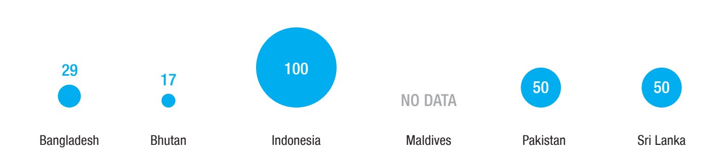
FIGURE 7: COUNTRY-WISE SCORES FOR PUBLIC PERCEPTION DIMENSION

The following figure shows that the average score of the ACAs for this dimension is in the range of from 17 (Bhutan) to 100 (Indonesia), with a mean of 49.2.