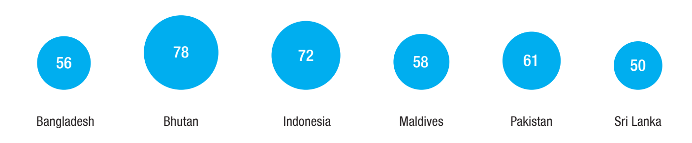
FIGURE 3: COUNTRY-WISE SCORES FOR THE DETECTION AND INVESTIGATION DIMENSION

The figure below shows that the average score of the ACAs for this dimension is in the range of from 50 (Sri Lanka) to 78 (Bhutan), with a mean of 62.5.