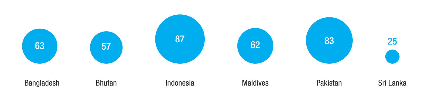
FIGURE 6: COUNTRY-WISE SCORES FOR ACCOUNTABILITY AND OVERSIGHT DIMENSION

The following figure shows that the average score of the ACAs for this dimension are in the range of from 25 (Sri Lanka) to 87 (Indonesia), with a mean of 62.8.